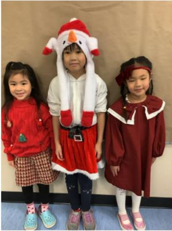
Festive Spirit Days At Quilchena