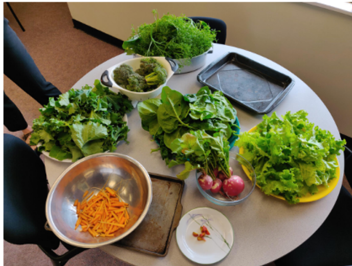
A Peek Into Some June Highlights