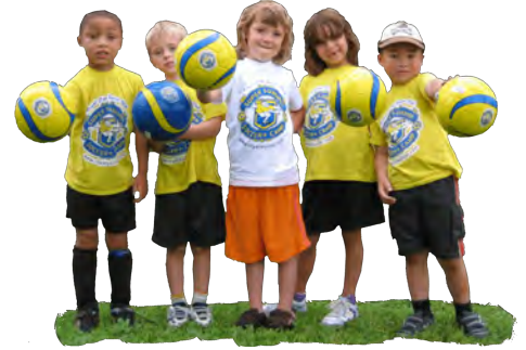
Royal Soccer Club reserves the right to update our programming, policies or terms and conditions per Public Health recommendations due to COVID-19. For more information on our sessions, <u>click here</u> or visit our website FAQs.